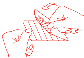
2.) Fold it.